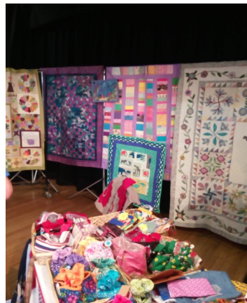
Bookham Village Day MVQ's Stand